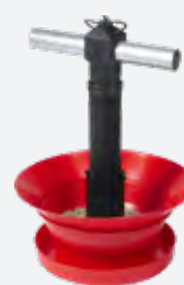
UPPER PAN FEEDER WITH COLLAR