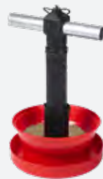
UPPER PAN FEEDER