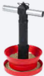
LOWER + UPPER PAN FEEDER