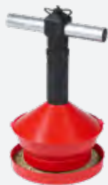
LOWER PAN FEEDER WITH LID

Accessories ► Collar for turkeys or ducks and grill for guinea fowls can be installed without removing the pan feeder.