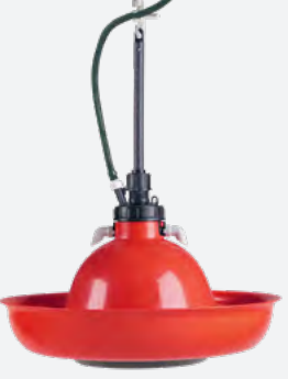
COMPACT TURKEY DRINKER