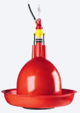
TURKEY AND DUCK DRINKER