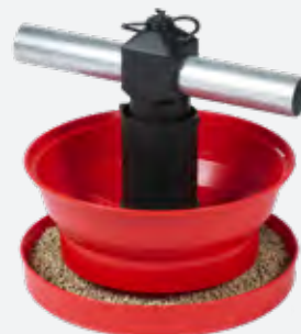
VERSION WITHOUT COVER BROILERS