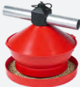
HEN COVER VERSION